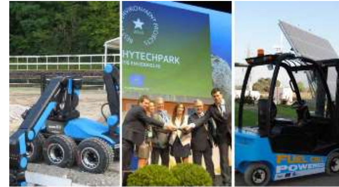
HYDROGEN MASTER PLAN IN ARAGON [2016 - 2020]

≈ €25 941 000 Global returns from open public calls